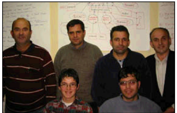
Kosovo Deaf Working Group

This is a new project for us and will be implemented in March 2003 depending on the funding decision from the Ministry for Foreign Affairs in Finland. There will be 3 projects in Kosovo – Organisational Support, Sign Language Work and Interpreter Training Programmes.