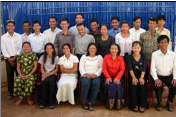
DDP Staff Members

DDP provides a non-formal education to disadvantaged deaf children and adults living Cambodia through offering a Khmer Sign Language and Literacy Teaching Programme. DDP operates in five provinces within the Kingdom of Cambodia. DDP is responsible for developing and researching Khmer Sign Language to disseminate within the Cambodian deaf Community. DDP currently employs 21 deaf and hearing staff members to operate the activities within the Programme. We are responsible for providing training programmes to all employees of DDP.